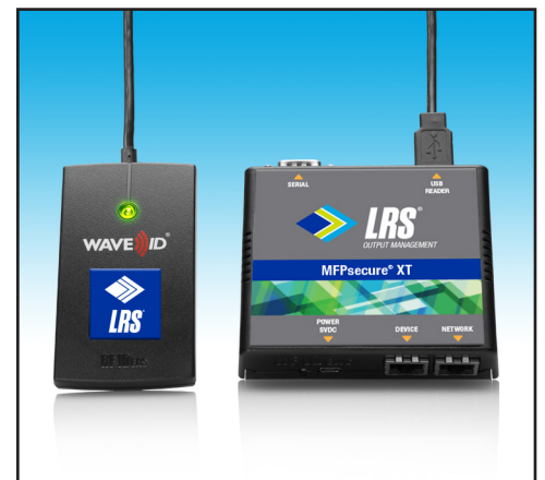
MFPsecure XT badge reader and network interface card

To securely retrieve documents at an MFPsecure XT-connected printer, a user simply taps an access badge on the proximity badge reader. All of the user's queued documents are released at once from the secure LRS server queue to the printer.