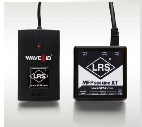
MFPsecure XT badge reader and network interface card

To securely retrieve documents at an MFPsecure XT-connected printer, a user simply taps an access badge on the proximity badge reader. All of the user's queued documents are released at once from the secure Enterprise Output Server queue to the printer.